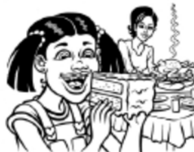
Boundary: rules involving dinner and desserts