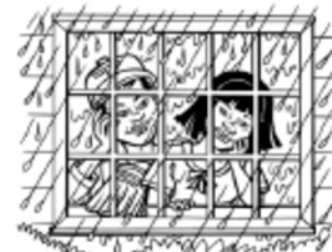
Boundary: playing outside

Discussion: Tell the children that the “Literal” boundaries are easy to understand because they are the things that provide limits, versus the “abstract” boundaries, which are typically involving rules and preferences. The following are questions to ask the children as they color the pages: