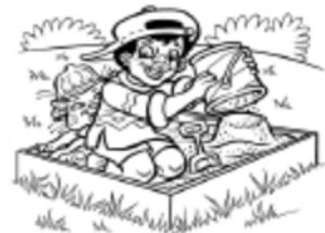
Boundary: sandbox walls