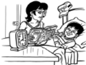
Boundary: bedtime rules