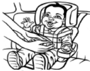
Boundaries: carseat / straps / seatbelt