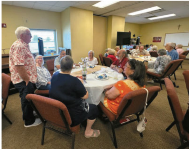
Senior Appreciation Luncheon on Thursday—August 17, 2023 at St. Patrick