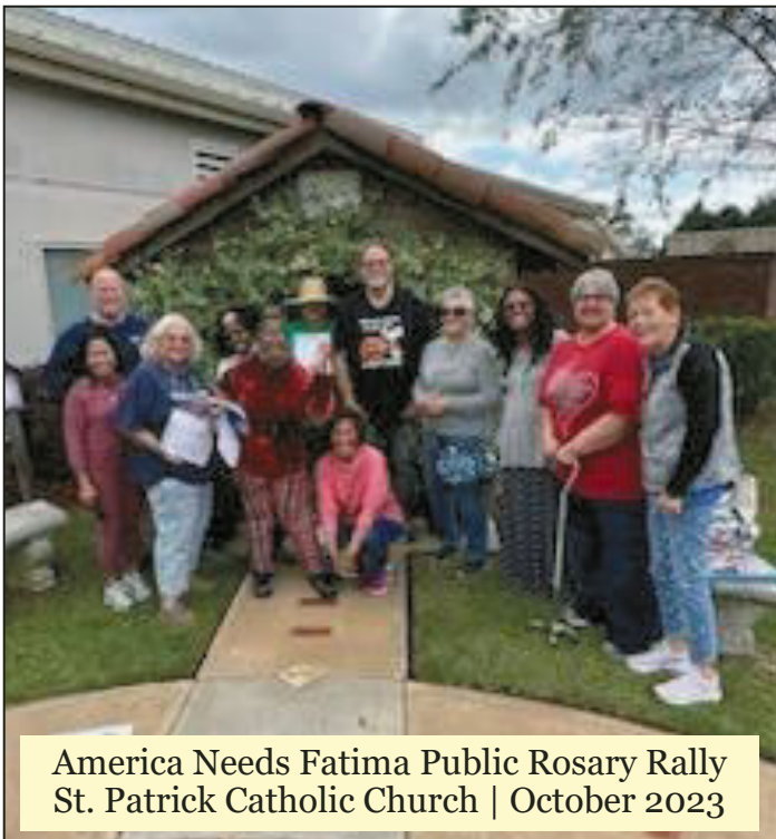
America Needs Fatima Public Rosary Rally St. Patrick Catholic Church | October 2023