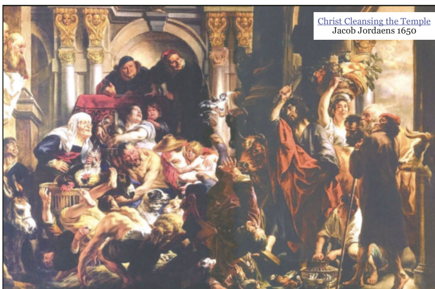
Christ Cleansing the Temple Jacob Jordaens 1650