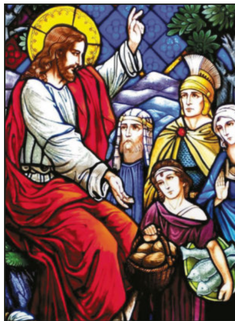
Loaves and Fishes | Derived from 1930's stained glass at St. Joseph's Catholic Church | Lakeland, FL